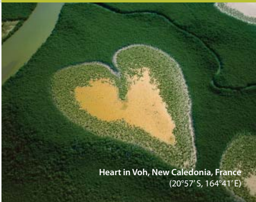
Heart in Voh, New Caledonia, France (20°57' S, 164°41' E)

Picture Earth is the first and leading organization dedicated to using art to help the general public embrace sustainable living.