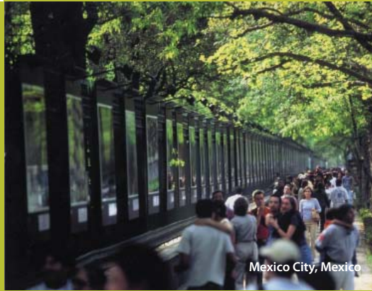
Mexico City, Mexico

EARTH FROM ABOVE will launch as the lead event for Earth Day's 40th anniversary in NYC followed by a 20-city tour through Los Angeles in October 2010, San Francisco in February 2011, and then cities nationwide.