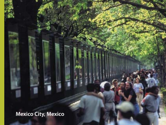
Mexico City, Mexico

Demonstrate your corporate social responsibility this Earth Day by featuring your company within this exciting platform. Connect your brand to a powerful touch point to deliver goodwill and indelible impressions to millions.