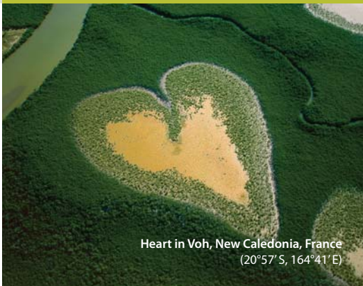
Heart in Voh, New Caledonia, France (20°57' S, 164°41' E)

Picture Earth is the first and leading organization dedicated to using art to help the general public embrace sustainable living.