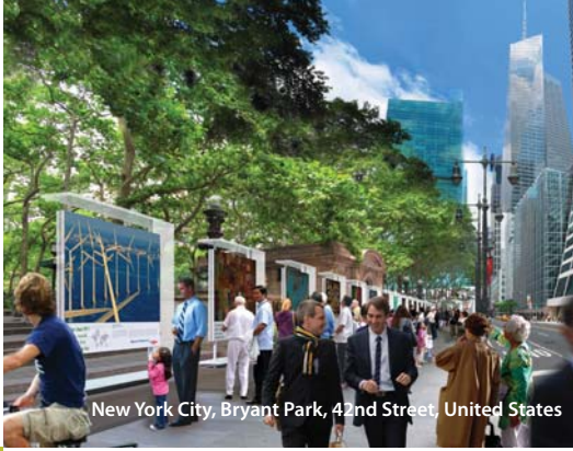
New York City, Bryant Park, 42nd Street, United States

EARTH FROM ABOVE is the premier platform for showcasing corporate commitment to a sustainable future.